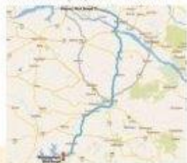
Mukutmanipur, from Asansol