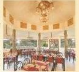
Multicuisine restaurant "MADOL"

From ethnic Bengali cuisine to Continental, from Indian to Chinese our signature multi cuisine restaurant "MADOL" has it all.