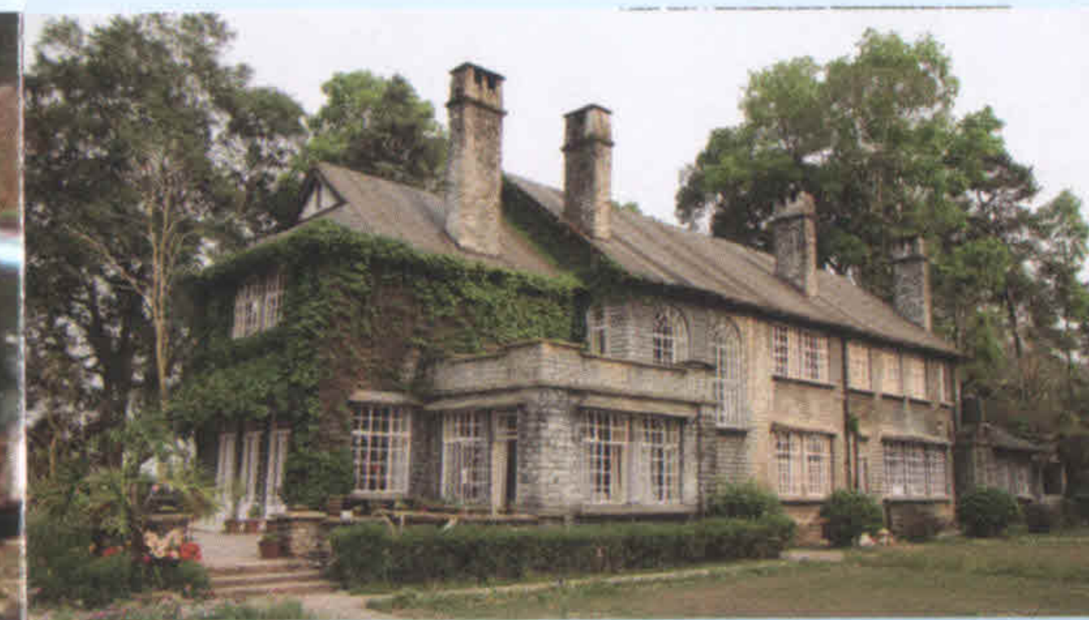
Morgan House Tourist Lodge