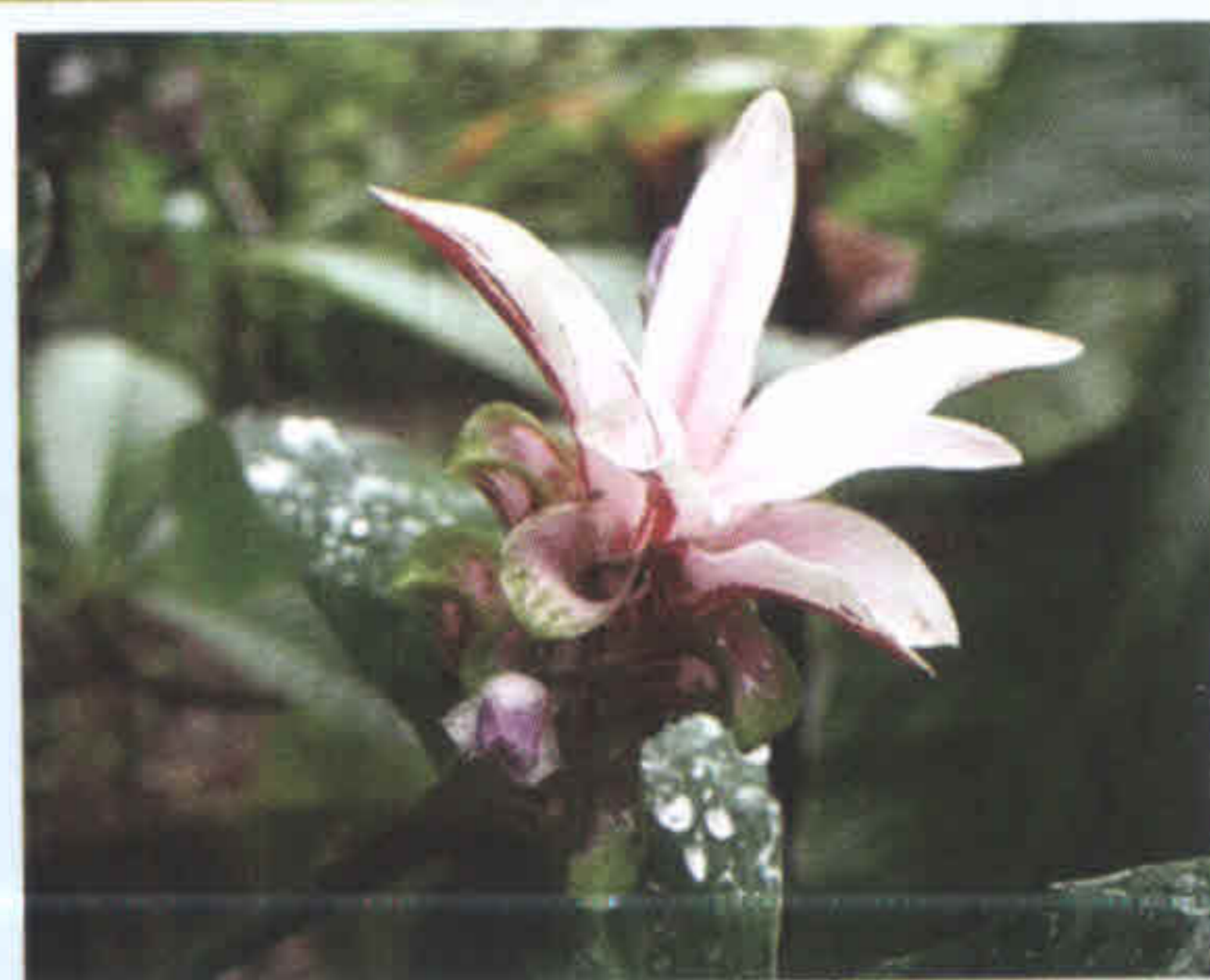
On the way near Kalimpong