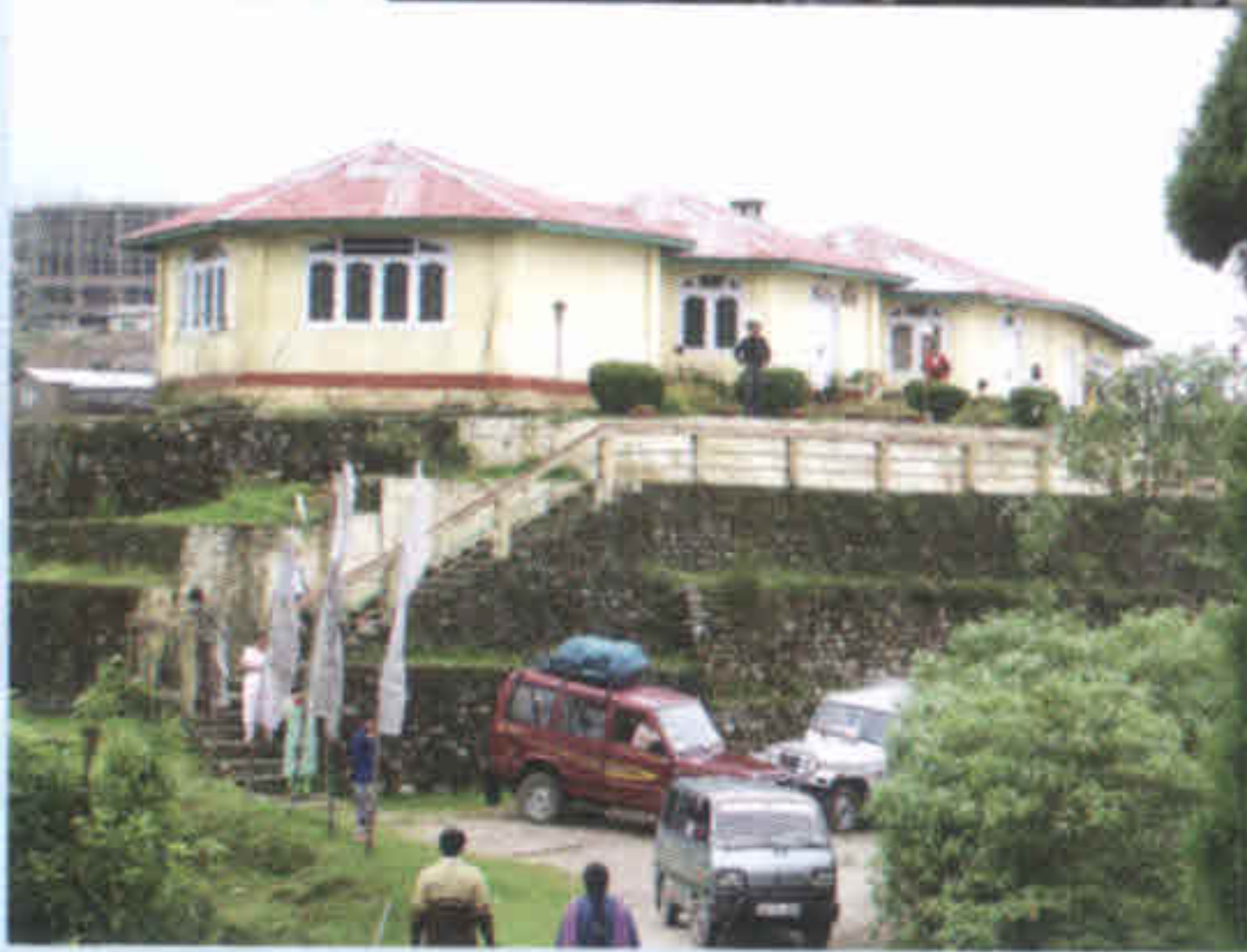
Way to Kalimpong